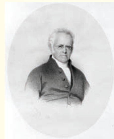
Rev. Henry Williams. Artist: Charles Baugniet. ATL: C-020-005.

Some commentators, however, suggest that it is the spirit of the Treaty that matters most, and that should override the ambiguities and differences of emphasis between the texts. Legally there is only one Treaty, despite the differences between the two texts. Current references to the Treaty in legislation seek to bridge the differences by referring to the "principles" of the Treaty, these being the core underlying concepts that underpin both texts. (See page 14 for a discussion of Treaty principles.)