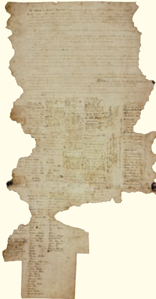
The Treaty of Waitangi - the Waitangi Sheet. Archives New Zealand: IA 9/9.

The copy of the Treaty signed at Waitangi on 6 February 1840, although it has been damaged over the years, is on display at Archives New Zealand in Wellington, along with eight other Treaty sheets that have survived.