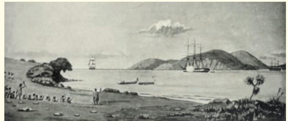
The landing of New Zealand's first Governor, Captain Hobson, Bay of Islands, 1840. Artist: Arthur Herbert Messenger. ATL: A-109-018.

In the Māori text of the Treaty, Māori agreed to give the Crown the right to buy land from them should Māori wish to sell.