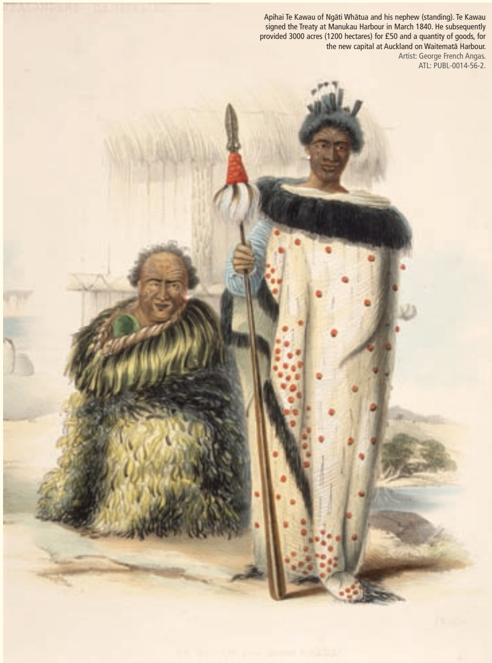
Apihai Te Kawau of Ngāti Whātua and his nephew (standing). Te Kawau signed the Treaty at Manukau Harbour in March 1840. He subsequently provided 3000 acres (1200 hectares) for £50 and a quantity of goods, for the new capital at Auckland on Waitematā Harbour.