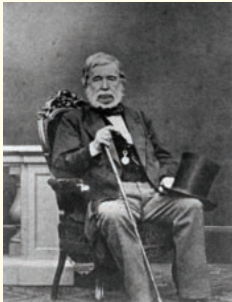
Thomas Bunbury, 1861. In March 1840, Bunbury was instructed by Governor Gipps to come to New Zealand with 100 men of his 80th Regiment to back up Hobson and, given Hobson's failing health, take over the Lieutenant-Governorship if necessary. He sailed down the east coast to Port Nicholson and to the South Island to gather Treaty signatures.

(6) "Government": "kawanatanga". There could be no possibility of the Māori signatories having any understanding of government in the sense of "sovereignty" i.e. any understanding on the basis of experience or cultural precedent.