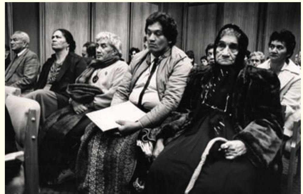
Dame Whina Cooper and others in the public gallery of the Court of Appeal, at the hearing of the New Zealand Māori Council case. The Dominion Post, 5 May 1987.

Since 1987, the Courts and the Waitangi Tribunal have developed a number of more detailed principles but the concepts of "partnership" and "active protection" have remained dominant. For a detailed list of the principles that have been developed see "He Tirohanga o Kawa ki te Tiriti o Waitangi: A Guide to the Principles of the Treaty of Waitangi", Te Puni Kōkiri, Wellington, 2001 ( http://www.tpk.govt.nz/publications ).