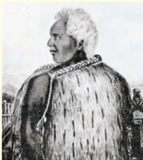
Te Ruki Kawiti, Ngā Puhi chief. Initially resisting British rule, he did not agree to the Treaty on 6th February, but his people pressed him to sign, which he did in May 1840.

More than 500 chiefs have their signatures or marks on one or other of the nine signed copies of the Treaty that have survived. At Waitangi and at Waikato Heads there were two texts, an English and a Māori text. Two hundred copies of the Māori text were printed on 17 February for distribution to potential signatories. Almost all the chiefs signed on one of a number of handwritten copies of the Treaty in Māori. Only 39 chiefs signed the English text of the Treaty.