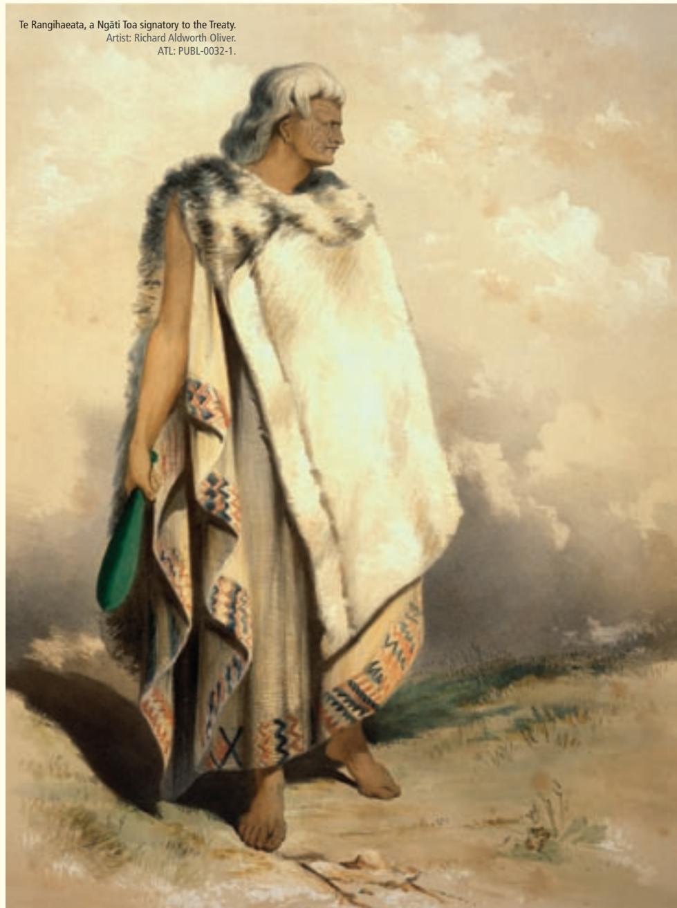
Te Rangihaeata, a Ngāti Toa signatory to the Treaty.

(11) There is, however, a more profound problem about "tikanga". There is a real sense here of the Queen "protecting" (i.e. allowing the preservation of) the Māori people's tikanga (i.e. customs) since no Māori could have had any understanding whatever of British tikanga (i.e. rights and duties of British subjects.) This, then, reinforces the guarantees in Article 2.