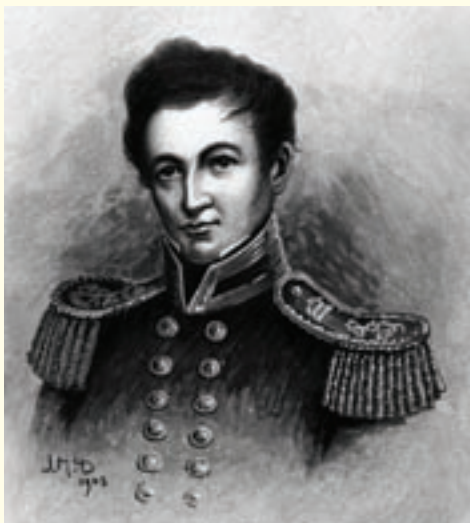
Captain William Hobson, R.N., signed the Treaty on behalf of the British Crown and later became the first Governor of New Zealand.

of Land by the Crown for the future Settlement of British Subjects must be confined to such Districts as the Natives can alienate without distress or serious inconvenience to themselves. To secure the observance of this rule will be one of the first duties of their official protector."