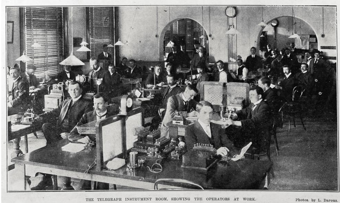
Figure 1 Telegraph operators at work (c.1900)